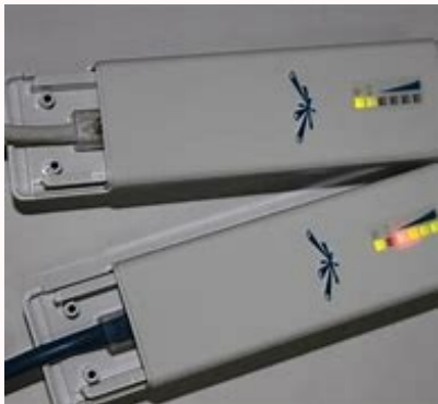
Ubnt picostation. Ubiquiti picostation m2 manual. Ubnt picostation m2 firmware.