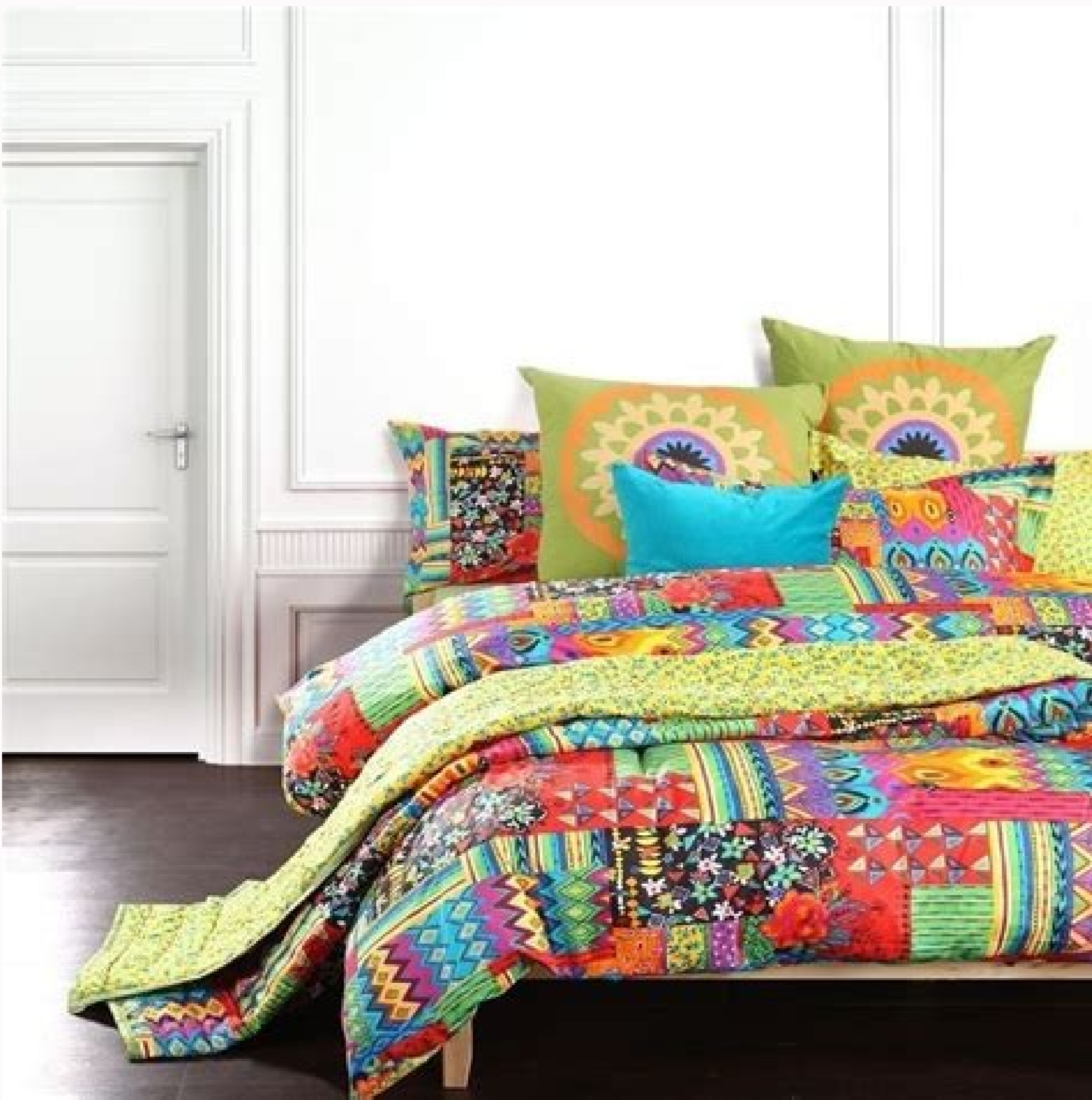
Target sheets queen bed