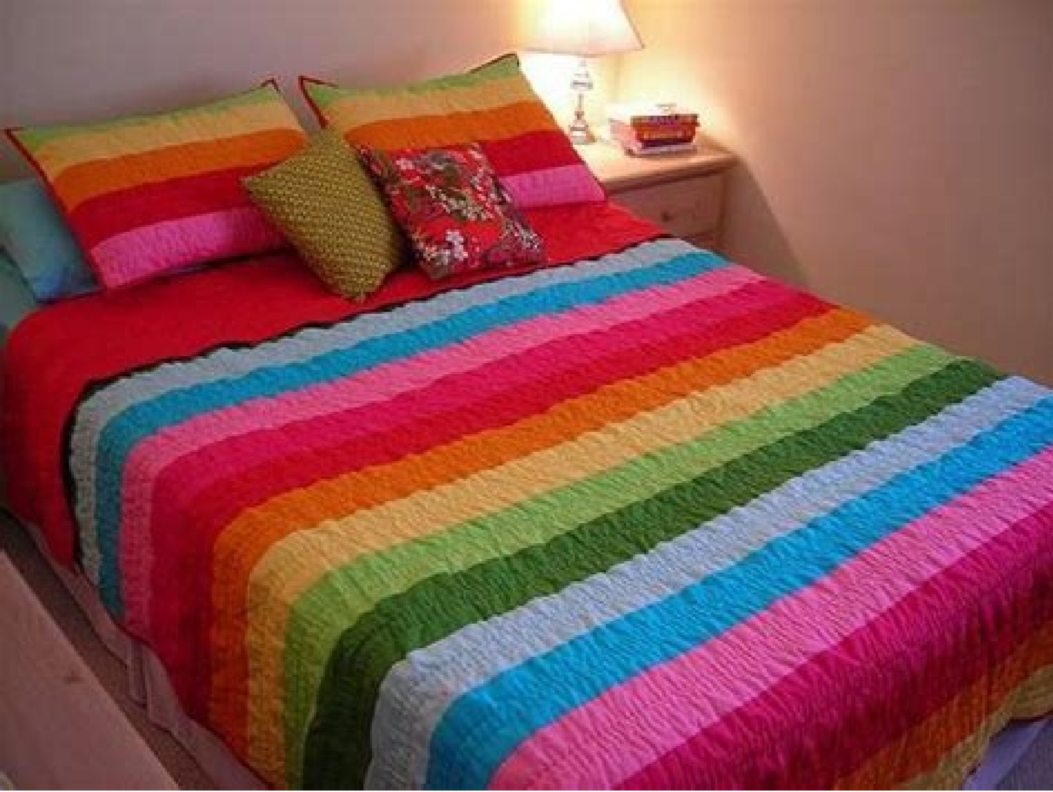
Target bed sheets queen fieldcrest. Pink bed sheets queen target. White bed sheets queen target. Cooling bed sheets queen target. Target bed sheets queen cotton. Queen size bed sheets target. Target queen bed fitted sheets.