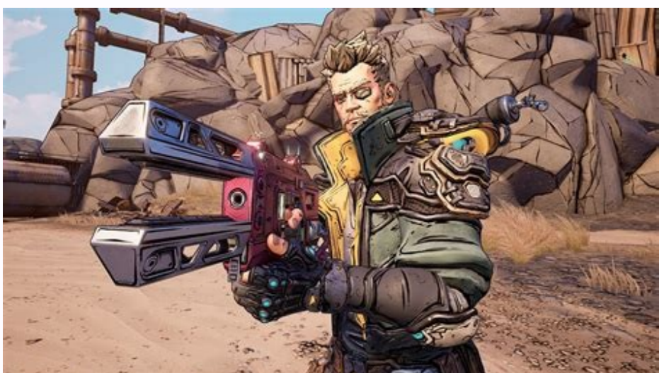
Borderlands 3 pc performance patch.