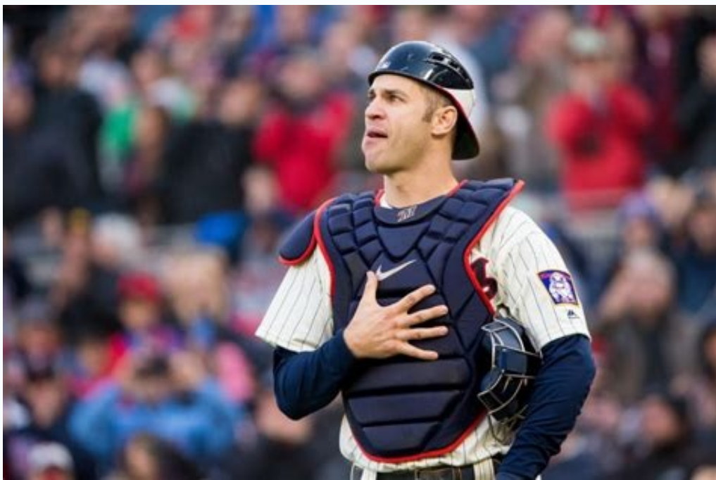
Mlb playoff schedule home away format. Mlb playoff format 2021 home and away.