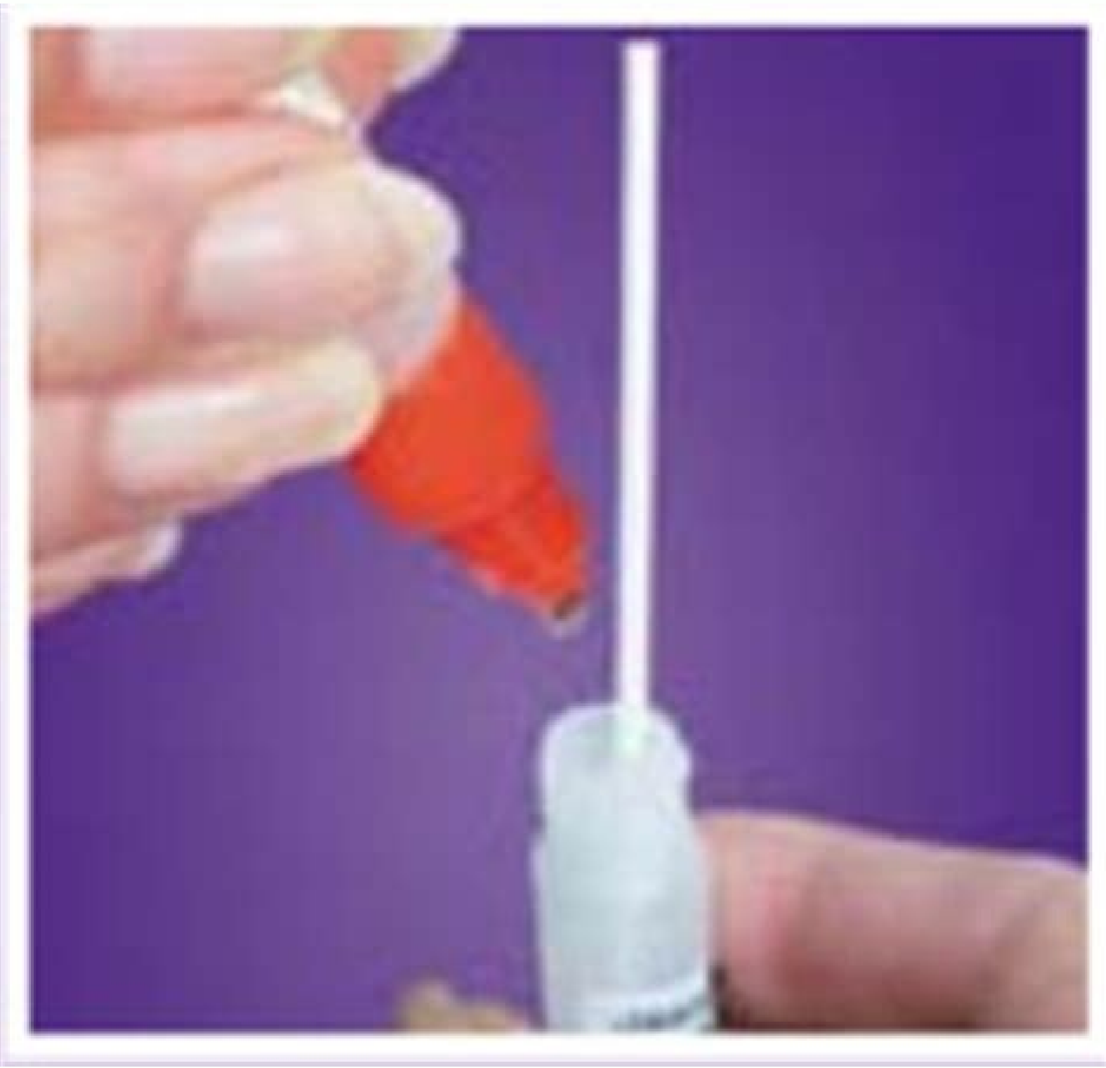
Who guidelines for chlamydia treatment.