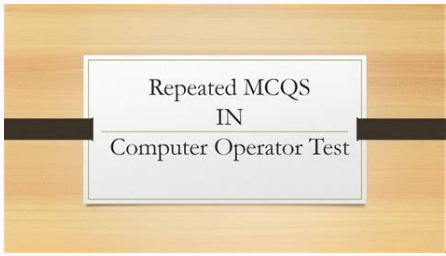
Basic mcqs of ms office pdf.