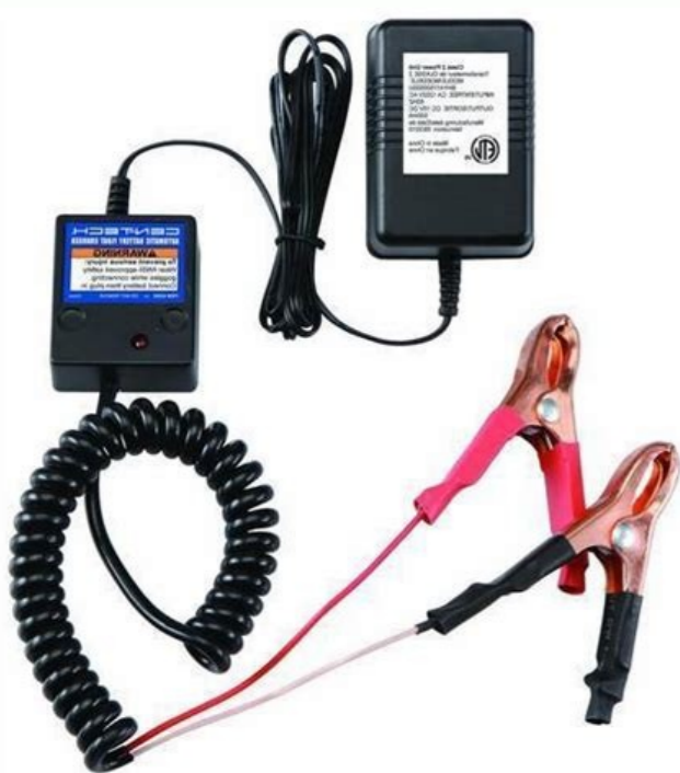
Cen-tech automatic battery float charger manual. What does an automatic battery float charger do. How to use cen tech automatic battery float charger.