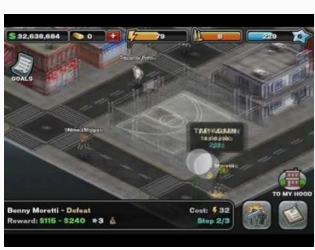
Crime crackdown vietsub.