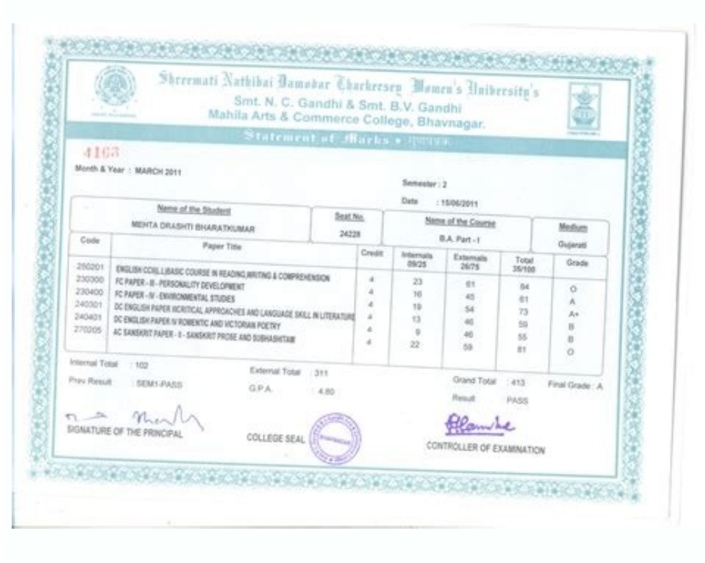
Ignou ba marksheet image. B.a result 2019.